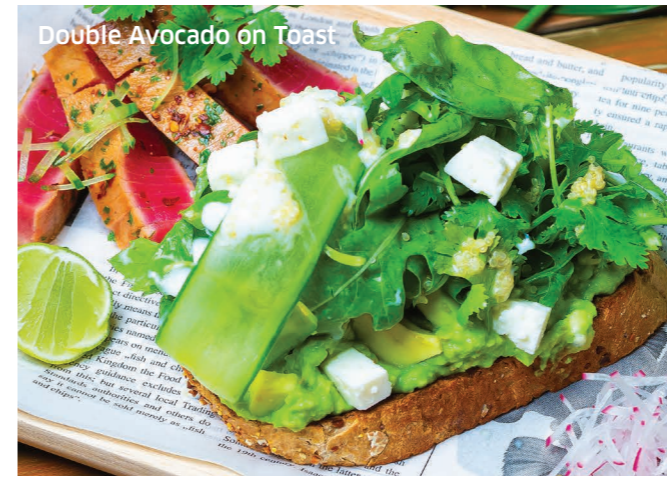
Double Avocado on Toast