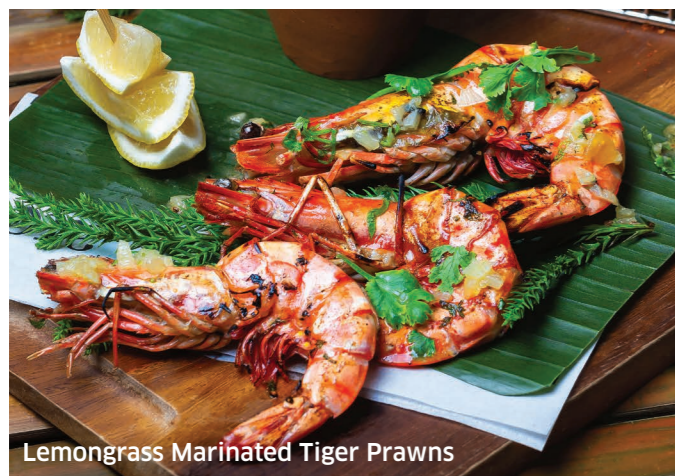
Lemongrass Marinated Tiger Prawns