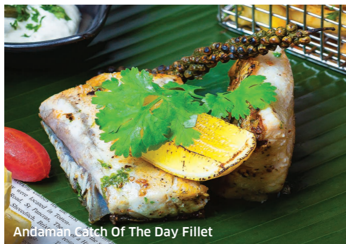
Andaman Catch Of The Day Fillet