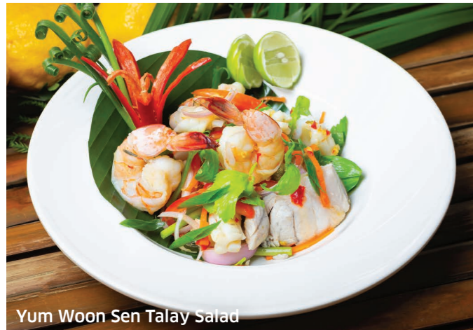
Yum Woon Sen Talay Salad