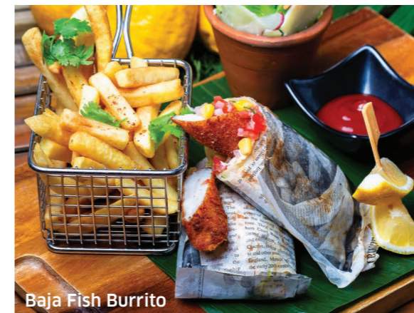
Baja Fish Burrito